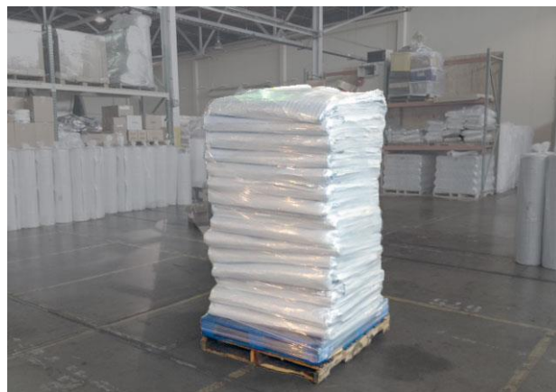
Blankets Folded, Palletized & Ready for Storage

Tri-Fold and stack on pallet for storage.